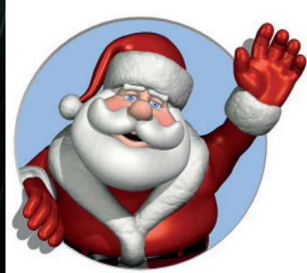
Seasons Greetings from all at EuroExpert!

The e-Bulletin is published periodically. It provides useful information for those who are either acting as an expert, who use their services or are in charge of setting standards for experts. EuroExpert (EE) is a point of contact between national and European judicial and legal authorities, government departments, official and private bodies and other appropriate tribunals.